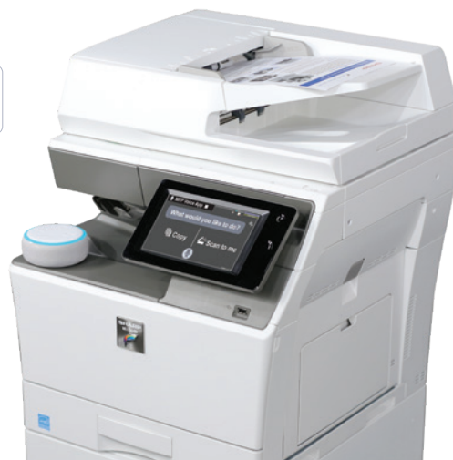
MX-B476WH shown with available Sharp MFP Voice feature with Alexa.

"Alexa, ask Sharp Copier to scan to me."