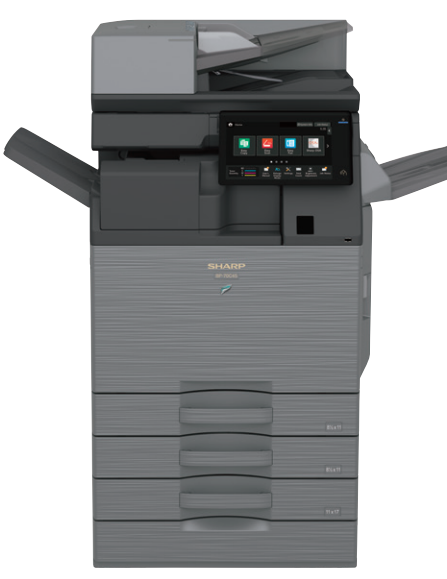
BP-70C45 shown with Inner Folding Unit, Right Side Exit Tray and 2-drawer Paper Deck.

10.1" (diagonally measured) customizable touchscreen display.